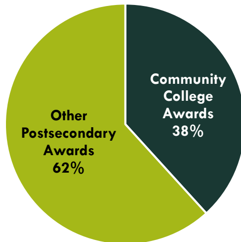
Exhibit 11: Percentage of community college awards compared to other postsecondary institution awards in the Los Angeles/Orange County region

Exhibit 11 shows the proportion of community college awards conferred in the greater Los Angeles/Orange County region compared to the number of other postsecondary awards for the programs in this report. The majority of awards conferred in these programs are awarded by other institutions in the greater Los Angeles/Orange County region.