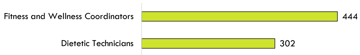
Exhibit 6: Job postings by occupation (last 12 months), Los Angeles and Orange counties

Job postings were analyzed for the most common job titles, skills, and employers associated with the target occupations in this report (Exhibit 7).