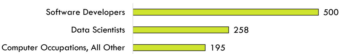
Exhibit 6: Job postings by occupation (last 12 months), Los Angeles and Orange counties

Job postings were analyzed for the most common job titles, skills, and employers associated with the target occupations in this report (Exhibit 7).