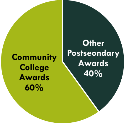
Exhibit 11: Percentage of community college awards compared to other postsecondary institution awards in the Los Angeles/Orange County region

Exhibit 11 shows the proportion of community college awards conferred in the greater Los Angeles/Orange County region compared to the number of other postsecondary awards for the programs in this report. The majority of awards conferred in these programs are awarded by community colleges in the greater Los Angeles/Orange County region.