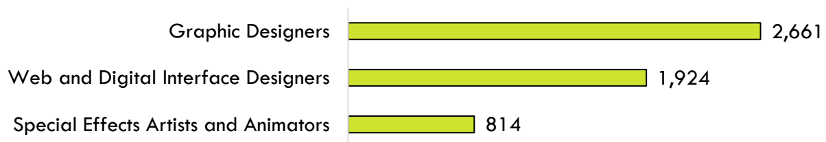
Exhibit 6: Job postings by occupation (last 12 months), Los Angeles and Orange counties

There were 5,399 online job postings related to graphic design listed in the past 12 months in Los Angeles and Orange counties. Exhibit 6 displays the number of job postings by occupation. The majority of job postings (49%) were for graphic designers , followed by web and digital interface designers (36%) and special effects artists and animators (15%).