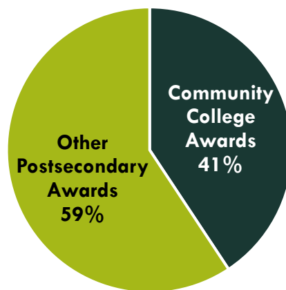
Exhibit 12: Percentage of community college awards compared to other postsecondary institution awards in the Los Angeles/Orange County region

Exhibit 12 shows the proportion of community college awards conferred in the greater Los Angeles/Orange County region compared to the number of other postsecondary awards for the programs in this report. The majority of awards conferred in these programs are awarded by other institutions in the greater Los Angeles/Orange County region.