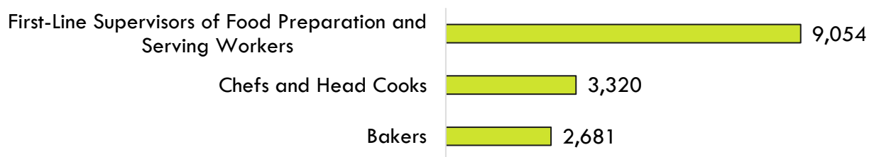
Exhibit 5: Job postings by occupation (last 12 months)

There were 15,055 online job postings related to these culinary arts occupations listed in the past 12 months. Exhibit 5 displays the number of job postings by occupation. The majority of job postings (60%) were for first-line supervisors of food preparation and serving workers , followed by chefs and head cooks (22%) and bakers (18%). The highest number of job postings were for shift leaders, shift supervisors, bakers, sous chefs, and team leads. The top skills were restaurant operation, food safety and sanitation, cooking, food preparation, food services, and baking. The top three employers, by number of job postings, in the region were: Starbucks, El Super, and Jack in the Box.