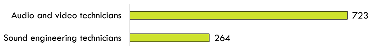
Exhibit 6: Job postings by occupation (last 12 months), Los Angeles and Orange counties

Job postings were also analyzed for the most common job titles, skills, and employers potentially hiring for the target occupations in this report (Exhibit 7).